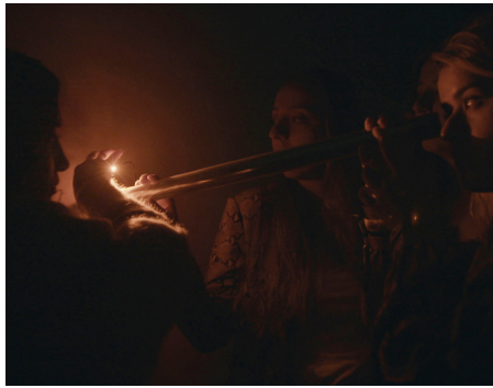
Realized 2019, 18 mins, documentary short