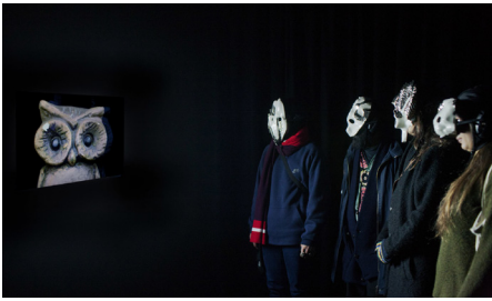
Realized 2020, Installation