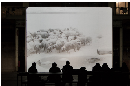
Realized 2018, Exhibition

Direction, script & editing: Eliane Esther Bots cinematography: Herman van den Bosch & Daniel de Oliveira Donato sound: Sergio Gonzalez Cuervo support: Stroom Den Haag, Netherland Film Fund distribution: EYE Film Screenings 2019: Nederlands Film Festival, Uppsala ISFF, Document Human Rights Festival Glasgow, Kassel Dokfest, Eastern Neighbours Film Festival screenings 2020: Glasgow International Short Film Festival, Movies that Matter Festival, Go Short IFF, Filmfest Dresden, Open City Documentary FF London, Reykjavik IFF, Valladolid IFF