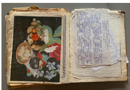
In post-production Documentary, 80 min, expected release 2024