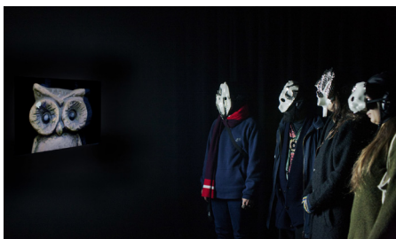
Premiere: Beautiful Distress House, 2020 Installation, 2020