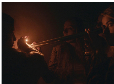
Premiere: Netherlands Film Festival 2019 Documentary short, 18 min, 2019