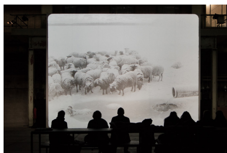
Exhibition: Electriciteitsfabriek Exhibition, 2018

Direction, script & editing: Eliane Esther Bots cinematography: Herman van den Bosch & Daniel de Oliveira Donato sound: Sergio Gonzalez Cuervo support: Stroom Den Haag, Netherlands Film Fund distribution: EYE Film Selected screenings: Uppsala ISFF, Document Human Rights Festival Glasgow, Kassel Dokfest, Eastern Neighbours Film Festival, Glasgow International Short Film Festival, Movies that Matter Festival, Go Short IFF, Filmfest Dresden, Open City Documentary FF London, Reykjavik IFF, Valladolid IFF